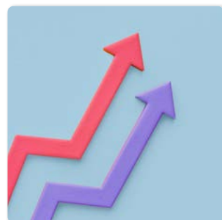
Career development and progression