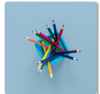
CV and cover letter writing