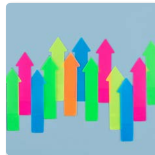
What makes you tick? Finding your values and purpose