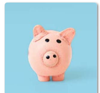
Money and mental health