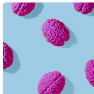
Disclosure of mental health at work